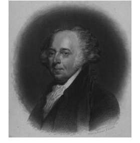
From a portrait by Gilbert Stuart