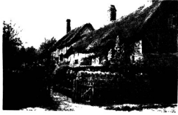
Ann Hathaway's Cottage by W.W. Quatremain.

the people with the doer and manner of the vile deed, with a bitter invective against the tyranny of the king: wherewith the people were so moved, that with one consent and a general acclamation the Tarquins were all exiled, and the state government changed from kings to consuls.